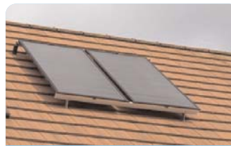
2m 2 of evacuated tube collectors

evacuated tubes are more conspicuous. The tube collector is however, more advanced and more efficient but also more expensive. A third type, called unglazed collectors are cheaper and used for swimming pool systems.