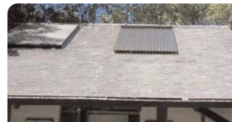
4m 2 of flat plate collectors (Energy Saving Trust)

Other systems are "open" or direct. In this situation the water that is heated by the collector is pumped into the tank and then drawn through hot water taps when required. Direct systems don't lose as much energy in heat transfer but require plastic expandable pipes to combat freezing and will need a water softener in a hard water areas.