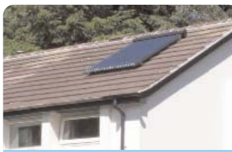
2m 2 of evacuated tube collectors

The capital cost of a solar system is more expensive than an equivalent fossil fuel system but as solar energy is free your yearly fuel costs will be reduced. In certain situations it is possible to 'pay back' the extra cost of installation. A solar system that replaces an on peak electric water heating system will save a 4+ person home around £162 per year. This means it would take 9 years to pay back for a DIY installation, 17 years for flat panels and 31 years for evacuated tubes (with grants). However, these systems should work effectively for 35 years and the price of fossil fuel derived energy is also likely to increase, thereby reducing these paybacks.